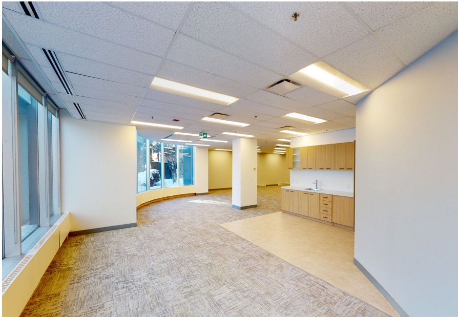
MODEL SUITE 1410 BLAIR TOWERS PLACE

Park of Commerce has a series of move-in ready model suites ranging in size up to 10,000 sq. ft. Crown's model suite program is second to none. Efficient layouts with high end build-outs result in spaces that tenants love.