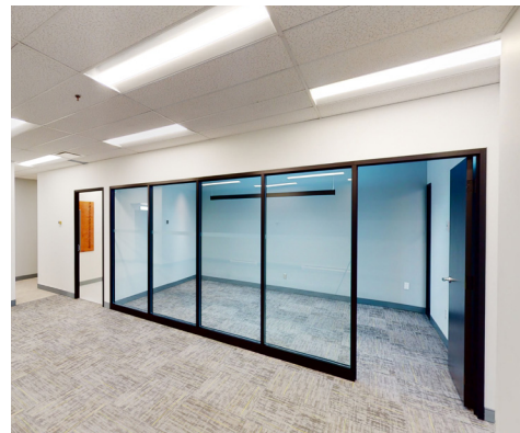
MODEL SUITE 1410 BLAIR TOWERS PLACE