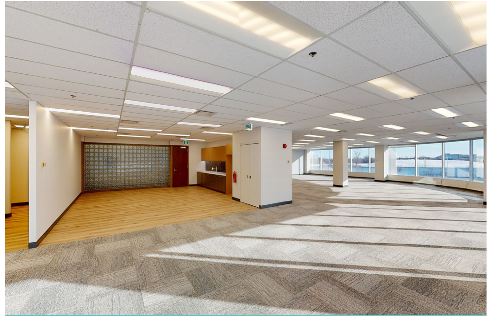
MODEL SUITE 1400 BLAIR TOWERS PLACE