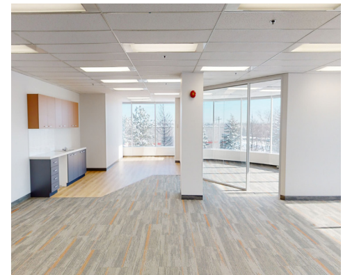
MODEL SUITE 1410 BLAIR TOWERS PLACE