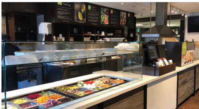
ON-SITE FOOD RETAILERS