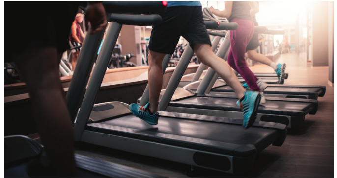
TENANT FITNESS CENTRE