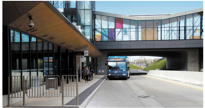
GREAT HIGHWAY & PUBLIC TRANSIT ACCESS