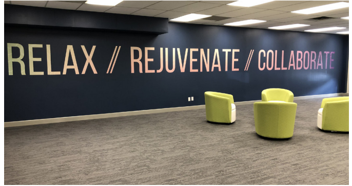
TENANT LOUNGE & CONFERENCE CENTRE

Collaborate with colleagues in outdoor surroundings with on-site terraces and picnic tables, take a stroll through Centennial Park or meet over a beer on the porch at the London Gate Pub.