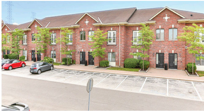
PARK AT YOUR FRONT DOOR