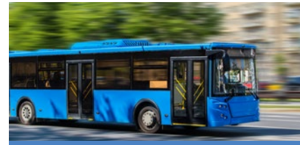
IMMEDIATE HWY 401 AND 427 ACCESS