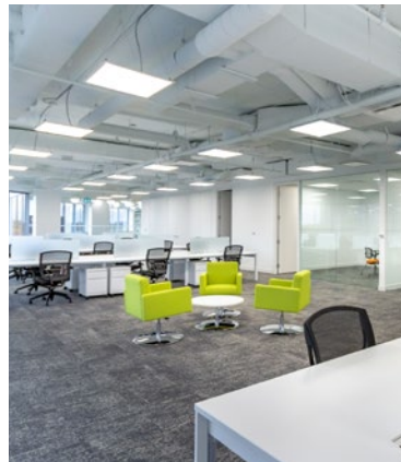
MODEL SUITES UNDERWAY