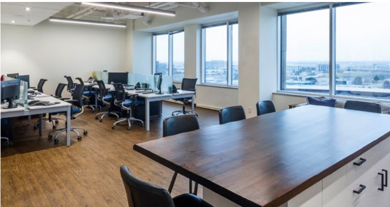
SUITE 902: 1,862 SQ. FT. OF MOVE-IN-READY SPACE